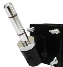
SKU Falcon Flag Connector 30° FAL-FM30D (flag mount) FAL-FLGCNCT (back plate)