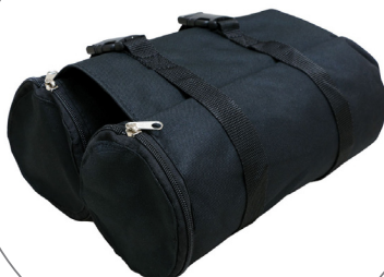
Sand Bag Cover CAS-SBAG