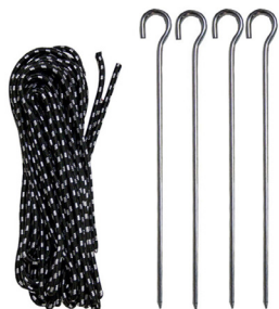
Ropes & Stakes CAS-RS