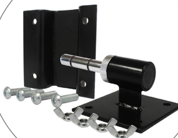
Falcon Flag Connector 0° FAL-FM0D (flag mount) FAL-FLGCNCT (back plate)