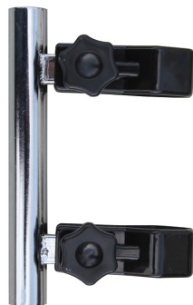
Feather Flag Connector CAS-FLGCNCT