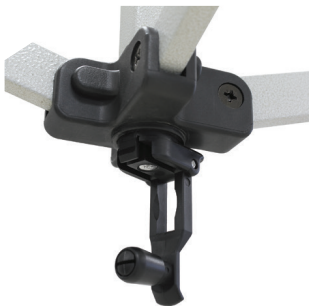
Crank for peak adjustment