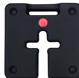
Plastic Water Base CAS-SQR-BASE