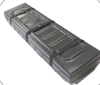
La Caja Hardcase LACAJA